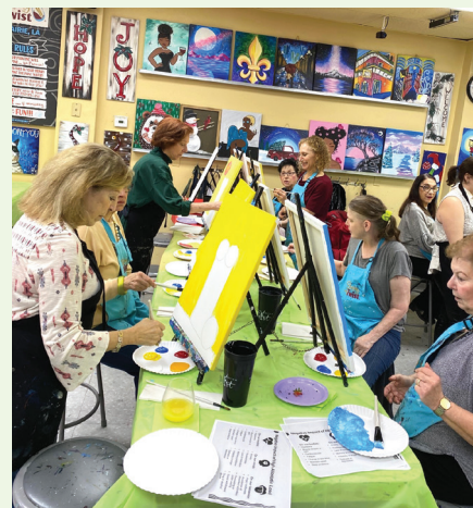
NCJW aspiring Picassos deep in thought and creation.

The third event in the 'Knowledge is Power' series will be focused on bringing accessible and affordable cancer genetic screening/testing to the community. Members are encouraged to get