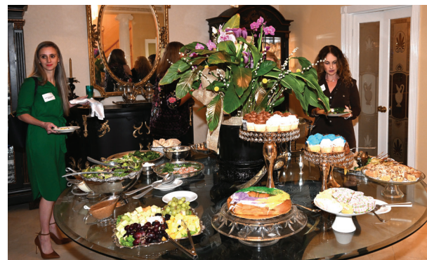
Delicious, delectable dining from appetizers to desserts were presented to party attendees