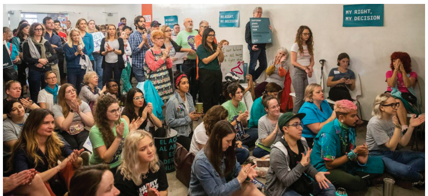
At a rally in March, NCJW-GNO members joined the many supporters of a woman's right to choose